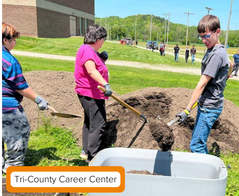
Tri-County Career Center